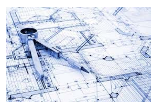
TMA HPR Loss Control Plan Review services are available to assist with your project