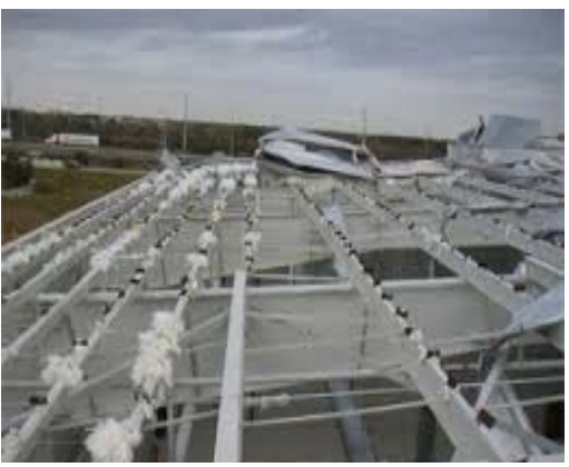
Roof failure has catastrophic consequences