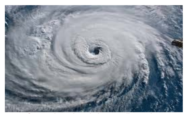
Strong, damaging winds can strike anytime.

The roof is a building's most critical and yet most vulnerable asset. Roofs serve the purpose of completing the building envelope along with the walls and floor; however, roofs carry the bulk of the load of a building's weatherproofing purpose. As critical as its foundation, a building's roof supports critical exterior loads, utilities, protection systems and equipment while serving to protect its assets from the elements. When the wind begins to blow, all elements of the roof must perform uniformly including equipment that is installed on the roof. Indeed, the foundation of any building's asset protection begins with the roof.