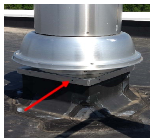
Exhaust fan with no base fasteners

The roof is a building's most critical and yet most vulnerable asset. When the wind begins to blow, all elements of the roof must perform uniformly including equipment that is installed on the roof. Similar to how seatbelts function in a car, well designed rooftop equipment securement will prevent equipment movement up to the limits of the structure's design. When subjected to high winds, inadequately secured rooftop equipment may be dislodged, resulting in severe damage to the roof cover and structure making the building more vulnerable to the ongoing wind threat.