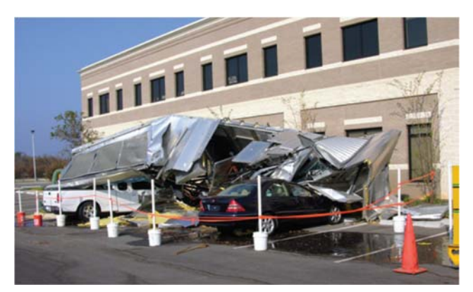
Even larger, heavier equipment may be blown off the roof when securement is deficient.

• Equipment mounted to steel framing – This equipment is commonly secured using beam clamps, welding, bolts or screws. Unlike packaged HVAC units on curbs, which are typically unsecured, equipment mounted on steel framing is typically secured to the framing. The most common error is using inadequately sized screws or bolts or installing equipment that is not rated for the applicable wind zone. Another common pitfall is not replacing rusted or broken fasteners as time passes. Use larger bolts (½ - 1 in.) for larger equipment and check or replace them periodically.