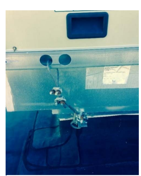
Packaged HVAC unit secured to curb using angle iron & cable ties

Packaged HVAC Units – This common equipment is installed on curbs positioned over a large opening in the roof where ductwork and utilities pass into the building. This equipment is typically installed without mechanical securement to the structure but is typically larger and heavier. In some cases, roof mounted