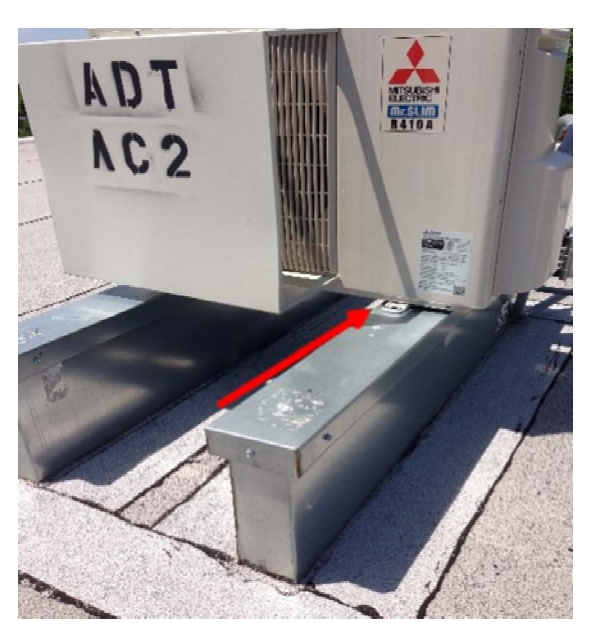
Split HVAC unit not secured to its curb

This guideline is intended to draw attention to typical rooftop equipment installation practices and deficiencies. Despite close attention being paid to windstorm resistance for roof structures and roof covers, some rooftop equipment is commonly installed without any means for securement other than weight. In addition, often there is less rigorous control over the methods used to secure equipment that is installed in between new construction or reroofing projects. If rooftop equipment is not well secured, it may become detached leaving the roof and all of the assets within the facility more vulnerable. From a risk assessment standpoint, severe damage to a building's roof can be a single point failure mode potential for the facility as a whole. Utilizing the approach outlined in this technical resource will equip the user to address rooftop equipment securement in both construction and retrofit circumstances.