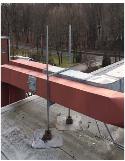
Ductwork secured using brackets via pitch pockets

Packaged HVAC Units – This common equipment is installed on curbs positioned over a large opening in the roof where ductwork and utilities pass into the building. This equipment is typically installed without mechanical securement to the structure but is typically larger and heavier. In some cases, roof mounted