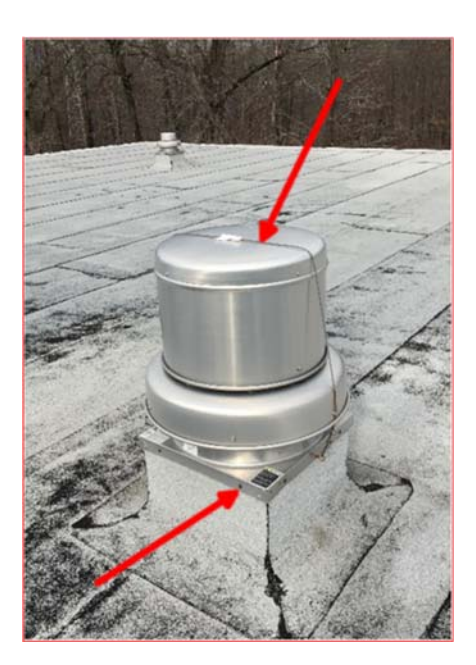
Well secured curb mounted exhaust fan; use two straps in high wind zones